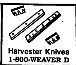
Harvester Knives 1-800-WEAVER D

Oliver Cletrac model AG-6, wide gauge model with Anderson dozer attach, side mount mower, good condition, low engine hrs.....$5,900 Roadscraper, pull type, 176" wheel base, $950 LEE BROS. CRANBERRY FARM 609-726-9292 Days 609-726-1214 evenings