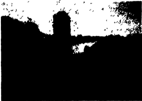
40'x105' Bank Barn