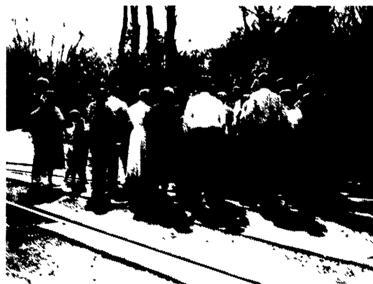
Groups gathered on White Oak Mills railroad tracks to begin a tour of White Oak's feed manufacturing facilities.

BUY, SELL, TRADE OR RENT THROUGH THE CLASSIFIED ADS PHONE: 717-626-1164 or 717-394-3047