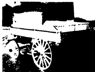
One of Sev. Hitch Wagons, Pony & Horse Sizes