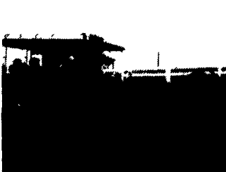
Pony Size Trolley