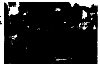
Kubota L2850 w/Loader