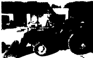
Kubota L3650 GST w/Loader, 900 Hrs.