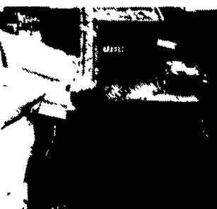
Wic Bale Chopper w/11 HP Honda & Hose For Landscaping Use