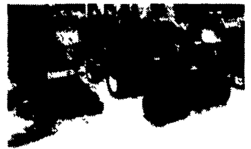
Kubota F2000 Or F2100 4x4 w/Front Mount Sno-Thrower