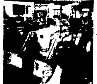
JD 670 4x4 w/Loaders, Only 90 Hrs., Excellent Condition