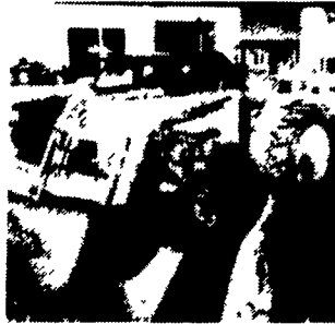
Ford 1710 4x4 w/Loader, Nice Tractor

We Have A Large Selection of 4x4's With Loaders