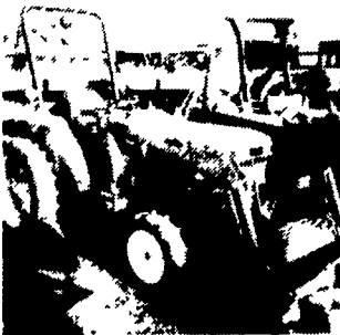
Ford 1320 4x4 w/Loader