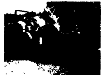
Kubota B9200 4x4 Hydro w/Loader Great For Snow Removal Low Hrs.