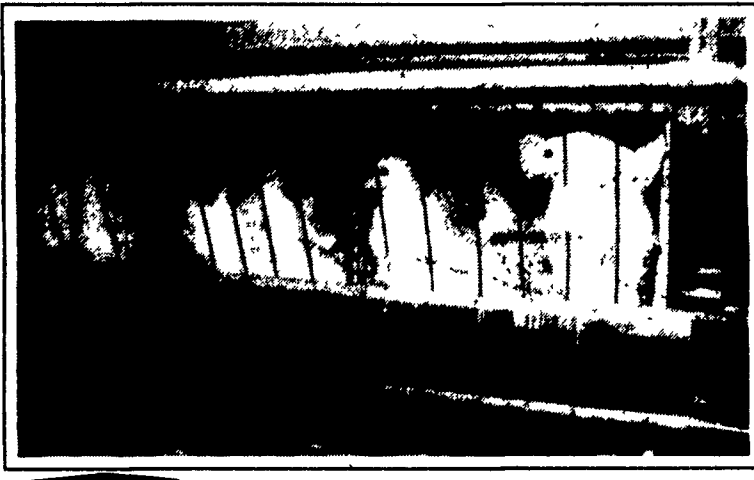
New style feed trough and new style heavy cage top and front. LUBING combi (red) nipple waters on stands.