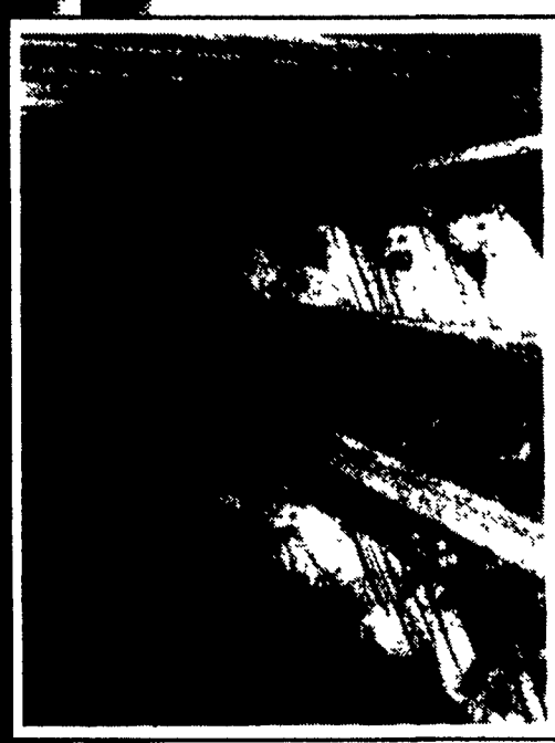
CHORE-TIME Tout Inlets installed over each cage row.