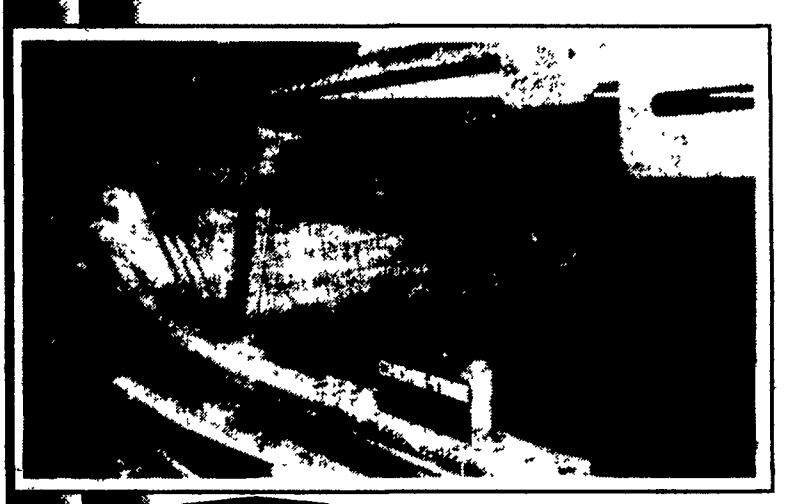
CHORE-TIME. Duratrim dropping board cage increases cubic inches of living space by over 20%. 6 bird cage decreases bird competition.