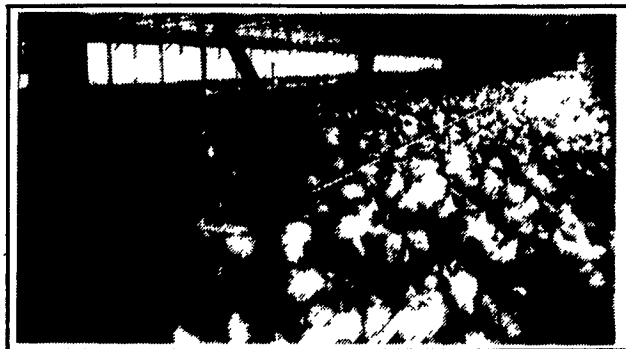
Inside Turkey Facility