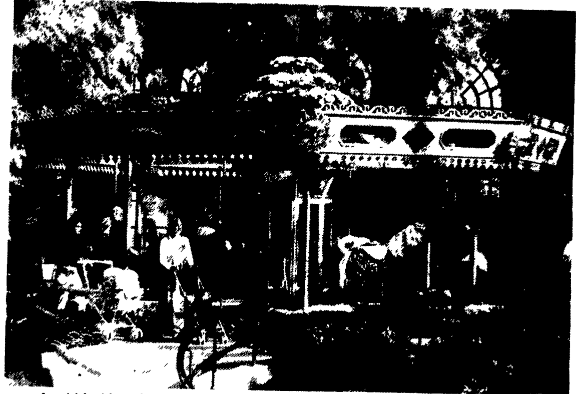
An old-fashioned carousel greets visitors as they enter Under the Big Top at Longwood Gardens Chrysanthemum Festival. Eight animals made from plants are set on the colorful frame built by Longwood craftsmen.