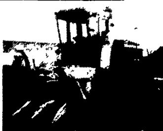
• 1985 Hesston 7600 Field Queen, 2300 Hrs., 3RN Cornhead, 3RW Cornhead, 7' Hay Pickup