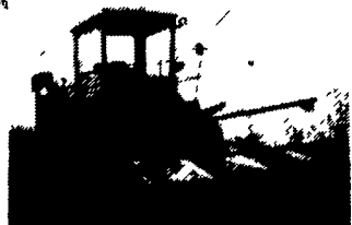
• 1991 NH 1915 4WD S.P. Forage Harvester, 800 Hrs., 4RN Cornhead, 10 Ft. Hay Head, Sharp!