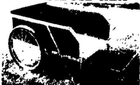
Photo is 15 Cu. Ft. Size