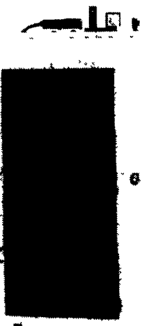
(Front view of Multifuel boiler)

Hand fired wood & coal models and outdoor boilers.