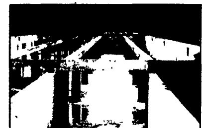
Concrete Pit Set-Up For Slatted Floors

Invest in Quality - It will last a lifetime.