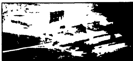
Far Left: 1-Million Gallon Circular Manure Storage Tank Far Right: 2 Silage Pits In-Barn Manure Receiving Pit