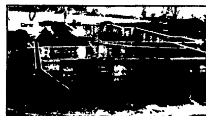
House Foundation Wall