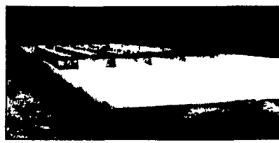
Manure Storage For Hog Confinement