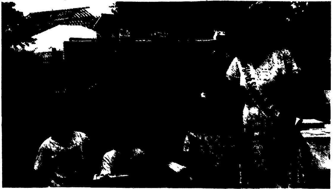
In celebration of 500 years of cattle in the New World, these children made birthday cards featuring beef and dairy cows. Cattle were brought by Christopher Columbus in 1494 on one of his later voyages to the New World. This activity created an awareness among the Queens children of where their food originates.

In addition to educating New York City residents about modern agriculture, Farm-City Council wanted to take it a step further by giving them a chance to visit the country.