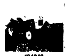
#24240 Mitsubishi 8-650-G Low Hours, Good Shape $3,975