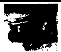
#24334 Ford Diesel Tractor 16 HP, 2 WD, Hyst. Trans w/Mid Mower, Low Hrs., Clean $5,995