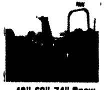
48"-62"-74" Snow Blowers In Stock