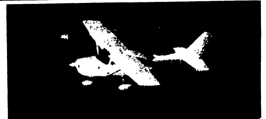
WE DO WHATEVER IT TAKES TO GET YOU YOUR PARTS...FAST !!!