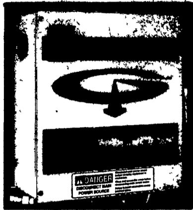
Alliance Unloader Control Panel