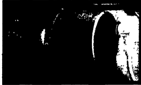
Arm Advance Sentry™ Electro-Mechanical Actuator

The Arm Advance Sentry™ arm control automatically monitors the length of time the cutter chain arm advances into the forage material. It also automatically cycles the time of material clean out. This advance-hold-advance-hold sequence results in more consistent delivery; less chance of bog down or reduced speed because of too much arm force; and more consistent loading of the motor. Only minor adjustments are required after initial dealer set-up – even as the forage material changes.