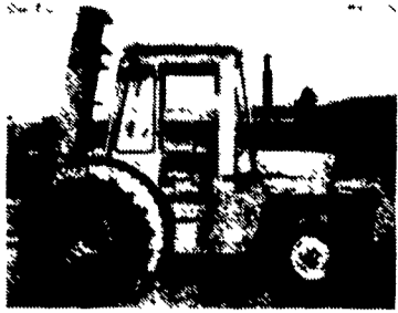
Warner Swasey Rough Terrain Forklift Ford gas engine with torque converter 6000 lb. cap. 12' mast side shift $5,600