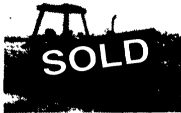
Case 580 Super D 1982 Tractor Loader, 3000 hrs. $5,200

LTM Equipment Co. Myerstown, PA 717/949-3582