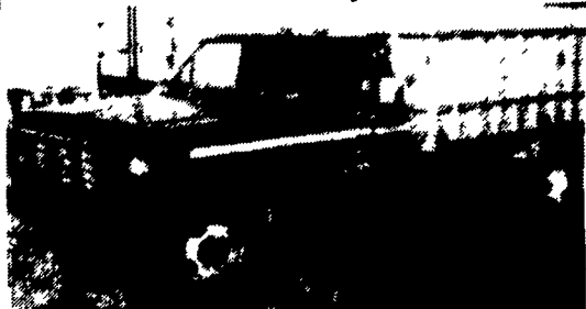
1984 Ford F-350 w/10 ft. Heway Aluminum Bed Diesel, 4 spd., good running condition