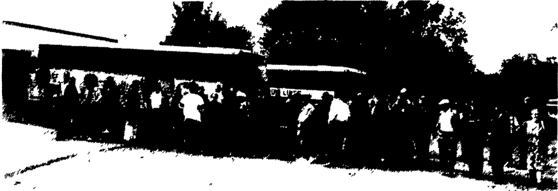
Two buses brought 84 Canadian farmers to visit the Manheim Farm Show on Tuesday. Farmers on both sides of the border enjoyed the time together.