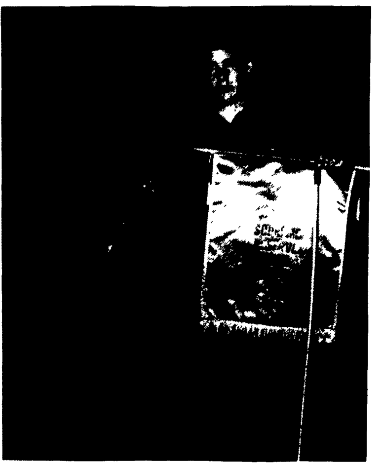
Casey High had the reserve supreme champion.