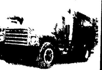
1981 INT 1654 H.D. Utility Truck 9.0L DSL Allison Automatic Trans AB 28 000 G V W 11' Body 45 000 Original Miles Owned & Maintained from new by a Utility Co

TWO ACRES OF ALL TYPES USED TRUCKS. "IF WE DON'T HAVE IT, WE'LL GET IT"