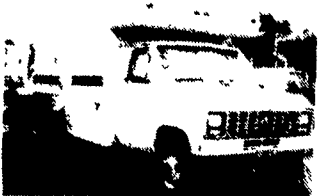
1987 FORD E350 ENCLOSED UTILITY 11' Gruman Alum Body Walk thru 351-V8 AT 4 WT Gen PS PB, AC, AM/FM, 62,000 Original Miles Very Clean, Must See