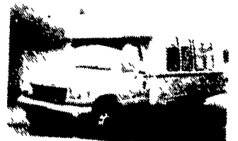
1992 E350 18 PASSENGER SHUTTLE BUS 351 V8 AT FT & Rear AC Owned & Maintained by Hotel Very Very Clean