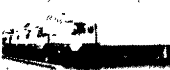
1989 MITSUBISHI FUSO FM 555 CAB OVER 24' MORGAN BOX-2500 lb. Anthony Truck Away liftgate 32,000 GVW-Full Air Brakes 5 SP 90,000 Miles Fleet Serviced With Records - VERY CLEAN.

Just Off I-78, Between Allentown & Quakertown Financing Pre-Approved