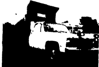
89 CHEVY 3500 DUMP 350 CID 4 Spd PS PB, GVW West PA Plow Frame Power UP/DN 43,000 miles A REAL WORKER