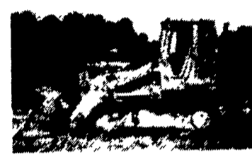
'83 Cat 963 GP Bucket with Teeth, Cab $42,000

We Buy & Sell Financing Or Lease Purchase Available