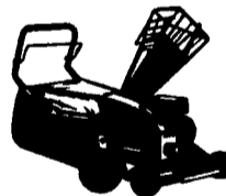
Chipper, gas engine, 16" drum, made by Asplundh Chipper Co. (Chelfont, PA) S/N JEX11700 $4,500