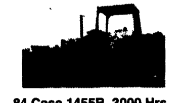
84 Case 1455B, 3000 Hrs., w/Ripper, New Pins & Bushings & Sprockets $24,900