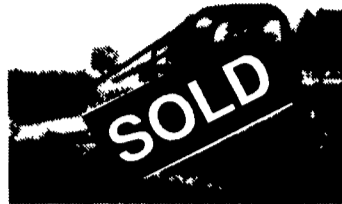
JD 550 w/ 6 Way, w/Winch New UC & Rebuilt Trans.