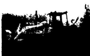
1985 JD 510B Turbo Tractor/Loader/Backhoe $19,900