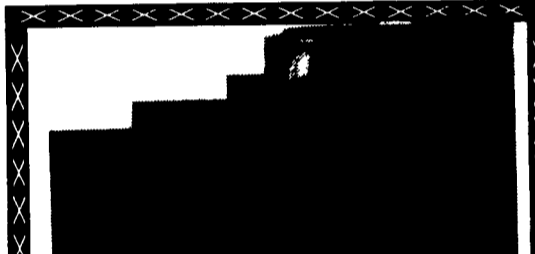
International 238 Diesel Wheel Loader, 3 Pt. hitch, Rear Blade $6,000

Heavy Equipment Loader Parts, Inc. RD 2, Box 2230, Route 22, Grantville, PA 17028 (717) 469-0039 (800) 446-0505