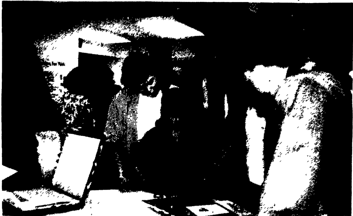
During the hospitality hour, guests examined the scrapbooks made by each princess.