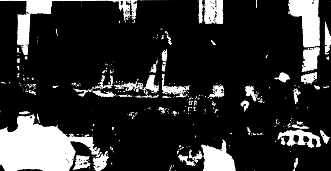
Tidy-Brook Sienna-ET, catalogue number one, was the first animal in the sale ring and topped the sale at $7,000.

The sale total was $138,000 with an average of $3,018 on 45 head.