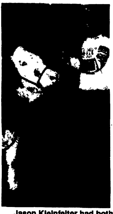
Jason Kleinfelter had both the reserve champion of the show and the reserve cham pion of the preview steers.