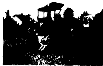
NH 1495 Fire Damage $5,900