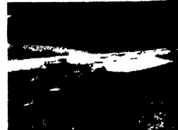
New Idea 5408 Disc Mower Ready to Go to Work on the Fall Grasses