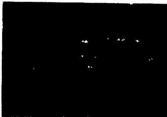
NH 162 Tedder $2,900