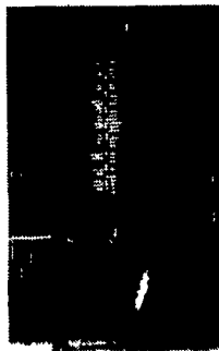
Models Available: Your Choice Of 6, 7, 9, 12 and 15 Ft. All Galvanized Hopper-Bottom Bins

We assemble, deliver & set-up bins on your farm