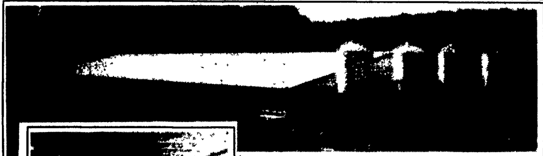
2000 HEAD FINISHER

Your Complete Poultry & Swine Building & Equipment Center