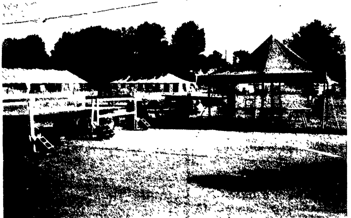
A familiar sight at the Ephrata Fair in the park. This year's special attraction will be the Grand Slam Award event for those who participate in the grain, seed, forage, tobacco, and pumpkin contests. An exhibitor can place an exhibit in each class and accumulate points for the Grand Slam Award, worth $250.