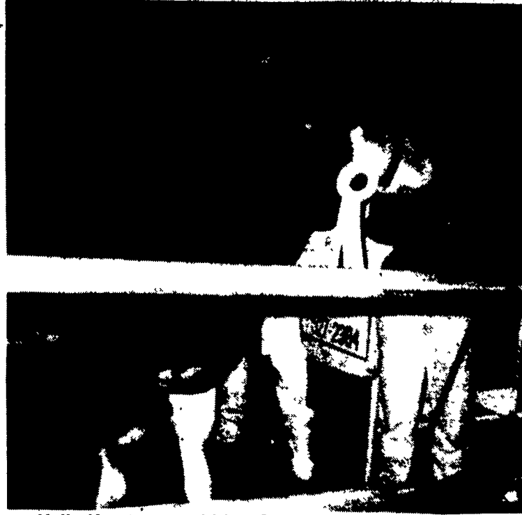
Kelly Kerstetter sold her Simmental reserve champion for $1.45 per pound for a total of $1,907, to Dick Berrier of IGA