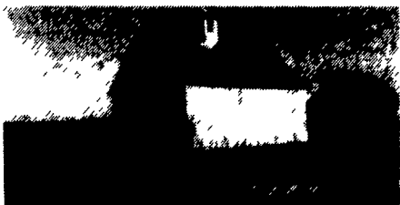
Use on Barns Or Garages