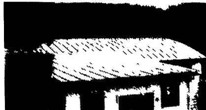
Good For All Roof Angles