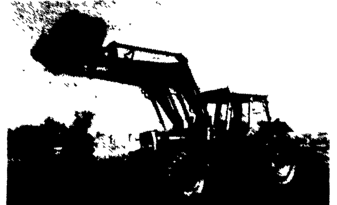
MF 399 all-purpose tractor with new Perkins 1000 Series Quadram Power 95 h.p. diesel engine