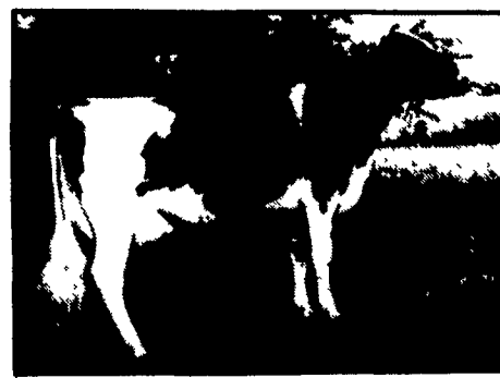
8H2410 Dancer +2,811M +67P +$274MFP 89%R +1.02 PTAT

Use them now for more future production and profit.