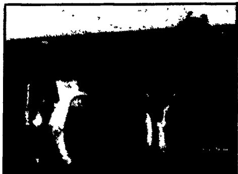
8H2215 Destruction +3,268M +79P +$329MFP 85%R +1.33 PTAT

rely on daughters of these bulls to really "fill 'er up":