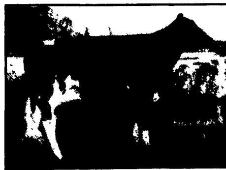
8H1959 Joy +2,954M +86P +$339MFP 86%R 8% EDBH