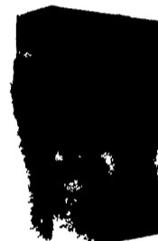
Farm Air Conditioner

•Optional corrosion free stainless steel housing and hardware