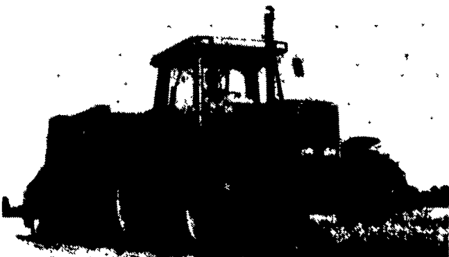
The new MF Dynashift powershift transmission, designed to deliver more useable power to the PTO and wheels, is now available for all Massey Ferguson tractors from 100 to 170 PTO horsepower. MF 3140 tractor (115 PTO hp) is shown.