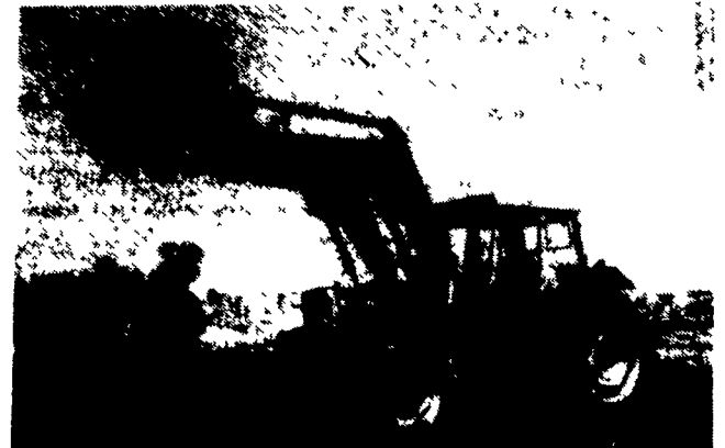
MF 399 all-purpose tractor with new Perkins 1000 Series Quadram Power 95 h.p. diesel engine

Stop in today to test drive the exciting new MF tractors.