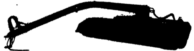
Case International Mower Conditioners