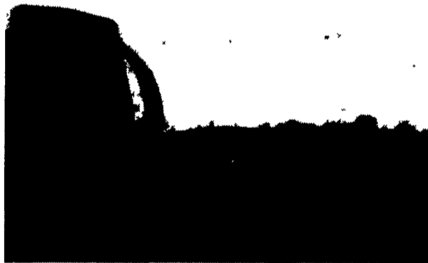
Case International Forage Harvesters

Special Fall Clearance Pricing on In Stock Equipment - First Come Basis