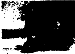
Ross Forklift, runs excellent $2,900

Bush Hog® King Cutter Ingersoll Garden Tractors