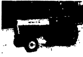
White 2-150 $5,900