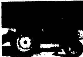
Case 585, New Rubber $6,000