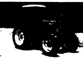
Ford 6710 4x4 w/cab & air $15,900