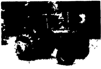
MF 2805 w/Cab $5,900