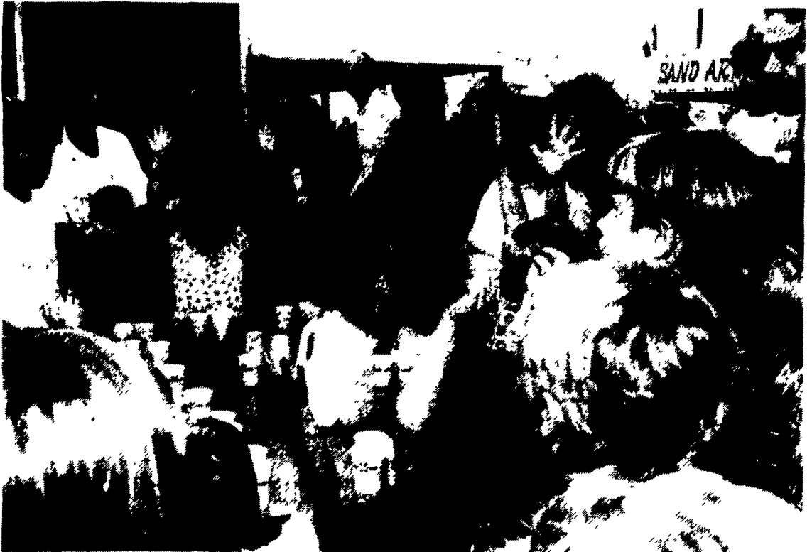
Participants prepare for the milk chugging contest at the Elizabethtown Fair.

Here are some activity pages from the book.