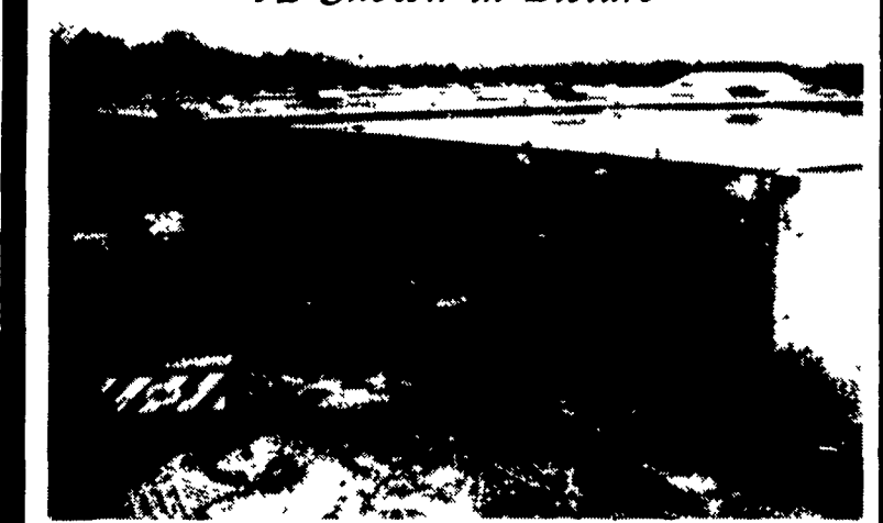
Block Wall Being Restored With Gunite