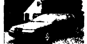
1990 Cougar XR7 3.8 Supercharged Auto, Air, Cruise, Tilt, Elec. Windows, Locks, Sunroof, Leather, Ride Control, 66,000 Miles, Red. $8,400.00