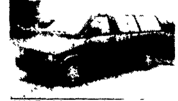
1991 Ford Aerostar XLT Extended 4.0 Liter Auto, Dual Air, Elec. Windows & Locks, Cruise, Tilt, 45,000 Miles, Black & Silver $11,800.00