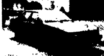
1986 Mazda 626 4 Dr., 5 Sp., Air, AM-FM Cass., 96,000 Miles, Blue. $2,500.00