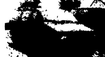
1989 Grand Voyager SE 3.0 Auto, Air, Cruise, Tilt, Privacy Glass, 52,000 Miles, 7/70 Factory Warranty, Black $9,900.00