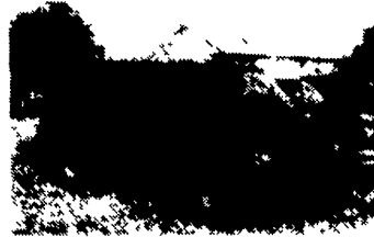
1993 Chevy Astro EXT, 8 Pass, 4.3, Auto, Air, Cruise, Tilt, Elec. Window & Locks, Black, Privacy Glass, 52,000 Miles. $13,900.00

955 E. Main St., Ephrata, PA (717) 738-4870 Specializing In Mini Vans