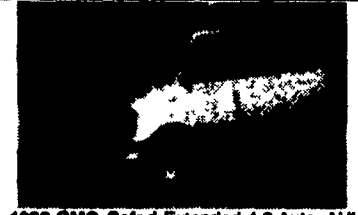
1992 GMC Safari Extended 4.3 Auto, AUL-Air, Cruise, Tilt, Elec. Windows & Locks, Quad Seating, Dark Glass, 35,000 Miles, Silver $13,900.00