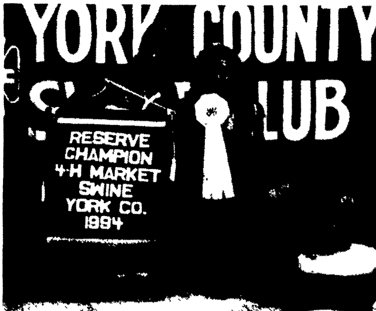
Exhibiting the York 4-H Roundup's reserve champion market hog was Kelly Myers. Byron Waggoner was the purchaser with a $4 per pound bid for Byron Waggoner Construction Company.