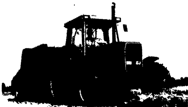
The new MF Dynashift powershift transmission, designed to deliver more useable power to the PTO and wheels, is now available for all Massey Ferguson tractors from 100 to 170 PTO horsepower. MF 3140 tractor (115 PTO hp) is shown.