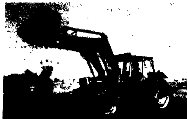
MF 399 all-purpose tractor with new Perkins 1000 Series Quadram Power 95 h.p. diesel engine.

Stop in today to test drive the exciting new MF tractors.