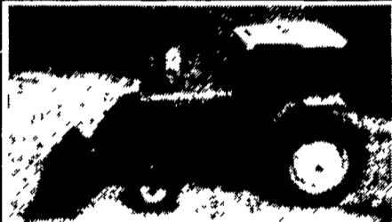
Ford TW-5 920 Hours, 105 HP, 2 WD, Cab, Ford Loader