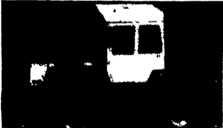
IH 4166 "Four Wheel Drive", 150 HP, 1900 Hours