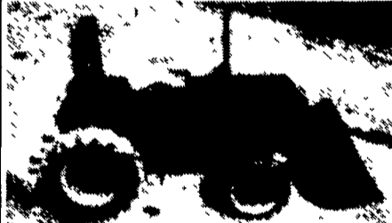
Case IH 385 MFD, ROPS, 770 Hours, C-IH 2200 Loader