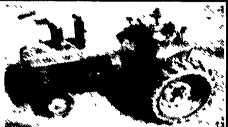
John Deere 4010, Narrow Front Diesel, Runs Good, 3400 Hours