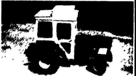
IH 784 "Orchard Type" Tractor, 67 HP, 2 WD, Cab