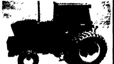
IH 5088 Tractor 130 HP, Cab, 2WD, 2900Hours, New Tires & Paint