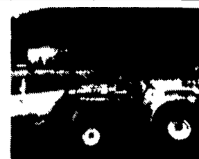
Ford 2110, 4WD Loader, Low Hrs., 38 HP Diesel $14,500