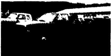
1994 Dodge RAM 3500 Laramie S.L.T., Dualie, Cummins Turbo Diesel, Auto, PS, PB, PW, PDL, Cruise, Tilt, Air, Trailing Tow Package, 410 Ratio, 7-Year 100,000 Mile Engine Warranty, Black & Red