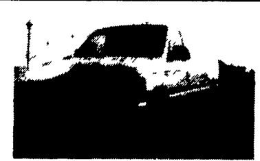
1993 FORD E250 CARGO EFI 300, AT, PS, PB, 7200 G.V.W., 33,000 Miles