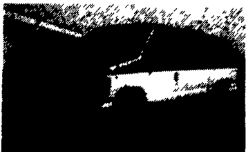
1993 FORD E350 SUPER XLT 15 PASS. EFI 351, ATO, PW, PL, Tilt, Cruise, Dual A/C & Heat, Like New, 26,000 Miles