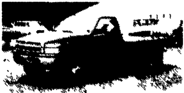
1994 Dodge 3500 1 Ton, 9 Ft Stake Bed, Cummins Turbo Diesel, 5-Speed, PS, PB, AM-FM, 11,000 GVW, 14,000 Miles, Will Sell With or Without Bed With Bal. of Factory Warranty, Red, Ex. Cond.