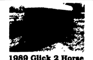
1989 Glick 2 Horse Trailer 14' Step On With Changing Room, Excellent Condition, Tandem Axle, Red w/White Roof #T099