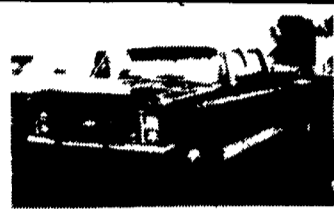
1985 Chevrolet C3500 Crew Dually 454 Auto, A/C, Silverado Red/White #C174