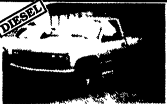
1989 Chev C1500 P.U. 6.2 Diesel, Auto OD, A/C, PL, PW, CR, Tilt, Silverado, Blue/Sil #C191