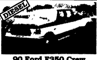
90 Ford F350 Crew Dually Diesel, 5 OD Manual, A/C, PW, PL, CR, Tilt, Blue/White #F250