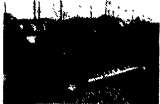
1988 Chevrolet C2500 Ext Cab 350 Auto, A/C, PW, PL, Kodiak Conv., Maroon #C194

WANT: Snow plow for Chevy S-10 or Blazer. (215)794-8004.