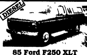
85 Ford F250 XLT Diesel, AT, A/C, Only 75,000 Miles, Charcoal Metallic w/Matching Cap #F230 $7,995