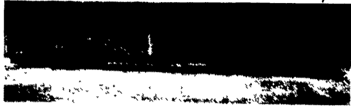
1987 Ford F350 Dually 460, Stick, Blue, 48,900 Miles, With 43'-2 Car Trailer, Gooseneck Ready To Haul Cars or Hay, Selling As Unit #F265 $10,950