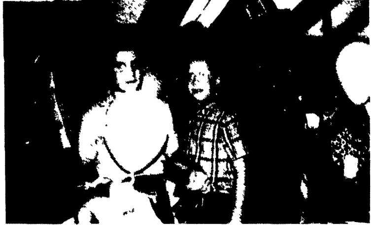
These boys stop to pick up an "I love milk" sticker handed out by Middle Atlantic Milk Marketing Association.