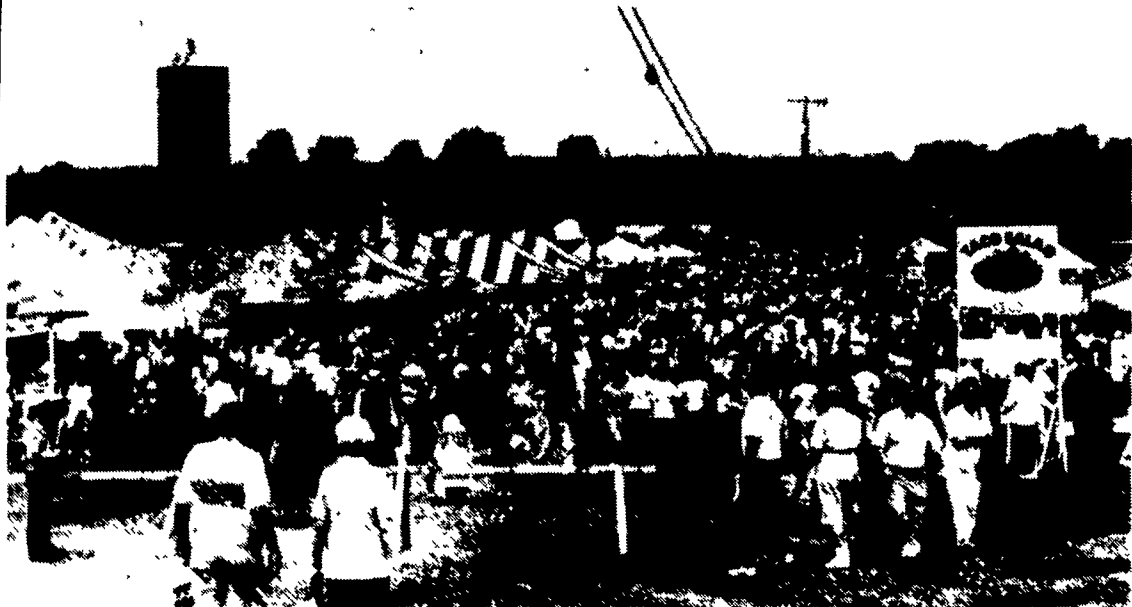
Crowds pack the Ag Progress grounds on Tuesday when ideal weather prevailed.