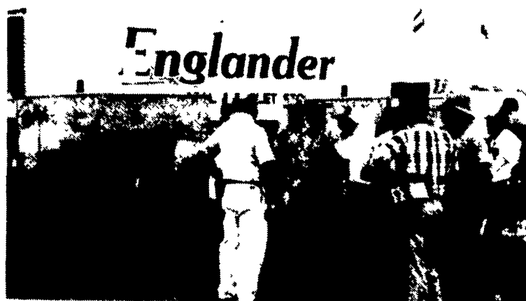
Although Ag Progress Days is held in summer, it's never too warm to discuss the latest in heating technologies.