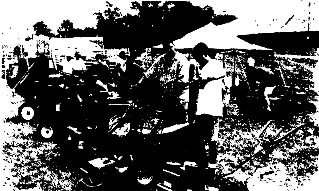
This group of visitors inspects models of garden equipment among the numerous equipment, machinery and educational displays at Ag Progress Days.