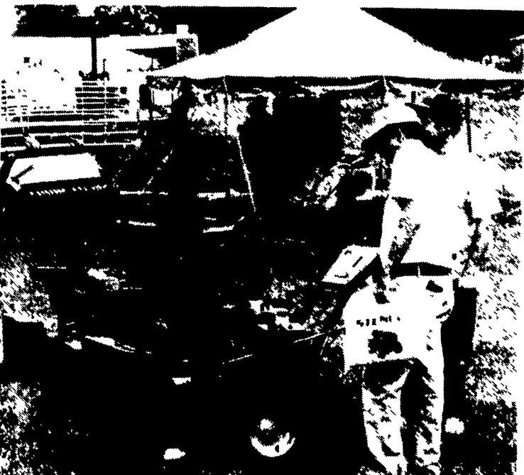
Like many others, these two visitors to Ag Progress Days are drawn to displays of snow blowers, apparently with memories of the past winter's record snows.