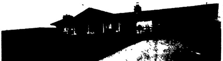
GOING TO THE DOGS?