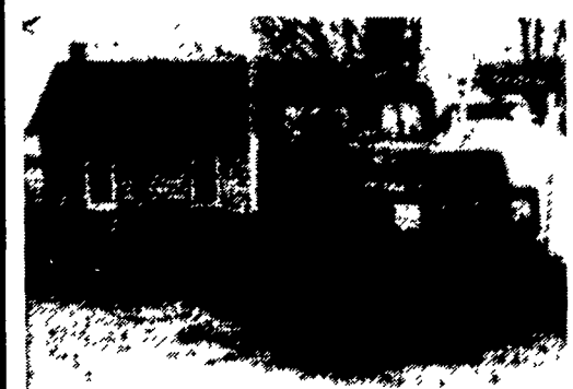
1968 MACK DM607S Tandem Cab & Chassis, 237 Mack, 5x3 Trans, Double Frame, 18F-44R, 134" Cab to Center of Tandems $8,500

Call 1-800-345-2829 Curry Supply Co. Curryville, Pa.