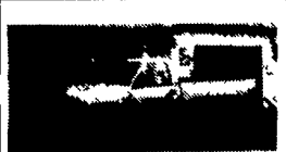
92 GMC Sierra SL 42,000 miles V-6, Auto AC, Bed Liner, Stereo

5466 Manheim Pike • East Petersburg 560-7779 QUALITY PREOWNED CARS & TRUCKS BANK FINANCING AVAILABLE • "MOST CARS WARRANTED" ALL CARS SERVICED & INSPECTED BY ASE CERTIFIED MECHANIC