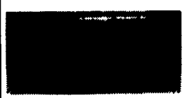
JEEPS 4 TO CHOOSE FROM!