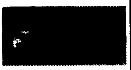
92 Dodge Dakota LE 4x4 6 Cyl, Auto, AC, Tile & Cruise Low, Low Miles; SHARP!