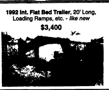
1992 Int. Flat Bed Trailer, 20' Long, Loading Ramps, etc. - like new $3,400

Ford Super Cab Rear Seat Lift Kit Raises seat 4" for more comfort includes all hardware & instructions. $79.95 Free Shipping! PA Residents Add $4.80 Tax Weaver Distributing 1-800-WEAVER-D RD 2 Box 470 Frederickburg, PA 17026